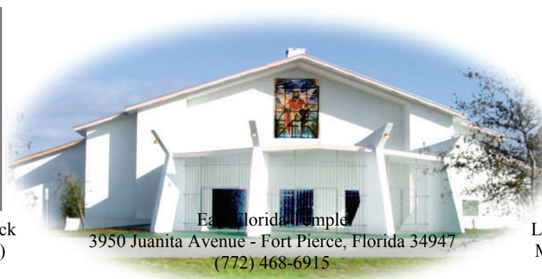
East Florida Temple 3950 Juanita Avenue - Fort Pierce, Florida 34947 (772) 468-6915